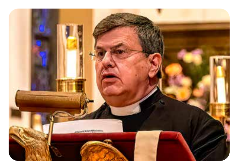
The first word the exiles heard God say to formless void was, "Light!" And there was, and it was good.

And what then? In the darkest days of their exile, isn't it amazing that Israel risked some of its most pushy, potent poetry like Genesis 1? Declaring in full-throated joy, "In the beginning, when there was nothing but the formless void, then God said, 'Let there be light!' And there was."